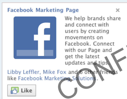
Home Page Engagement Ad

Below please find preliminary mocks of ad units that allow users to connect with Pages, in 1-click. Please keep in mind that these designs are not final and are highly confidential at this time.